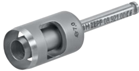
08.921.00 NIZAM Ring Punch

Soft tissue augmentation with ring-shaped keratinized tissue grafts (KTG), harvested with the NIZAM Ring Punch.